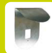
stainless steel rain shield