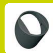
plastic round cover anthracite and white