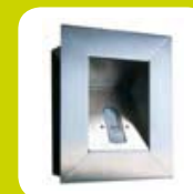
stainless steel in-wall mounting set